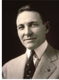
Arch C. Klumph, founder of The Rotary Foundation, circa 1916

In 1917, RI President Arch C. Klumph proposed that an endowment be set up “for the purpose of doing good in the world.” In 1928, when the endowment fund had grown to more than US$5,000, it was renamed The Rotary Foundation, and it became a distinct entity within Rotary International.